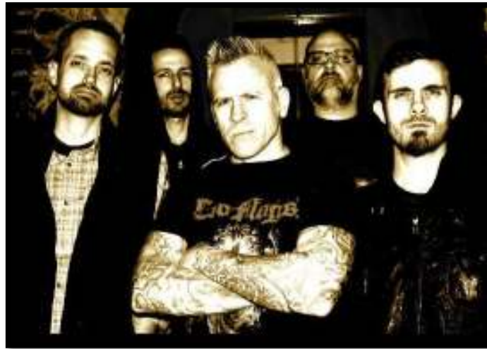
ABOVE: The Run Devil Run band members

After these tours, I felt I might hang it up. I had just gotten married and was accepted into the laborer's union in Cleveland. As a band, we discussed our future and decided to record one more album and see how it went. Just after recording our second record, it was picked up by Victory Records and was set to be released in the U.S. and Canada. Victory is the biggest label in the world for our style of music. They released such Krishnacore bands as Shelter , Baby Gopal , and Cause For Alarm .