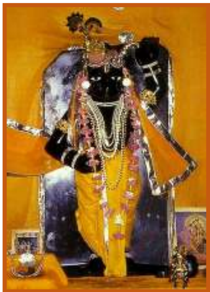
ABOVE: Madhavendra Puri's original Gopal deity

Madhavendra Puri wanted to taste a little of it so that he could prepare a similar sweet rice for his own Deity, Gopala. But Madhavendra immediately checked this