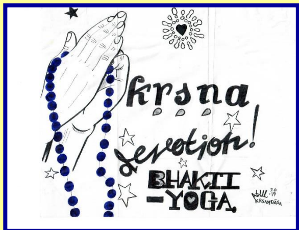
LEFT: Drawing by inmate Atul Kṛṣṇa dasa