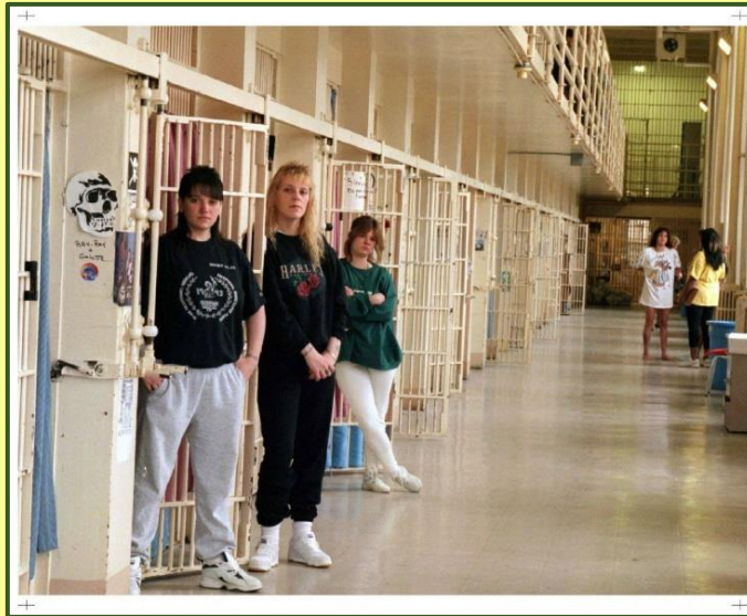
Above: stock image