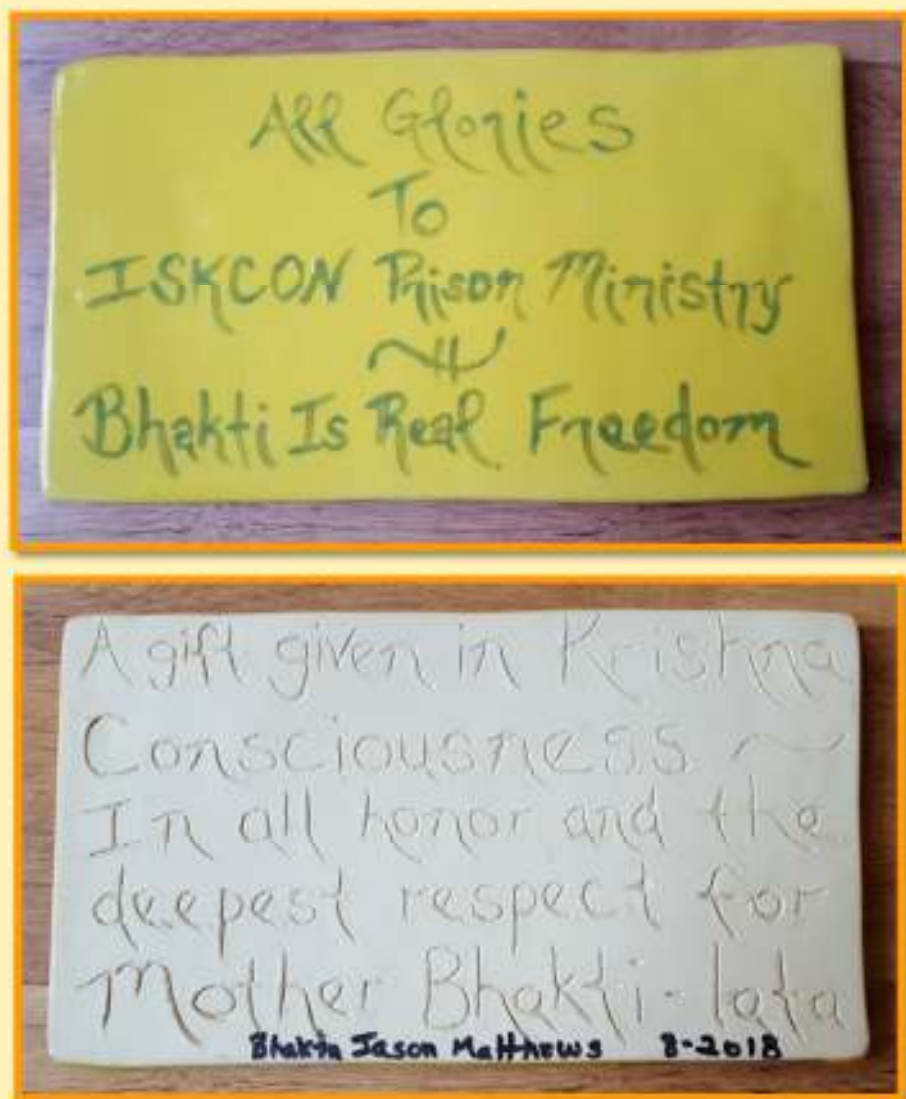
Bhakta Jason's Pottery Gift