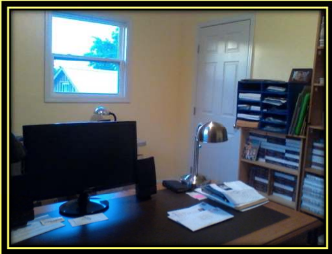
The new IPM office in Prabhupada House