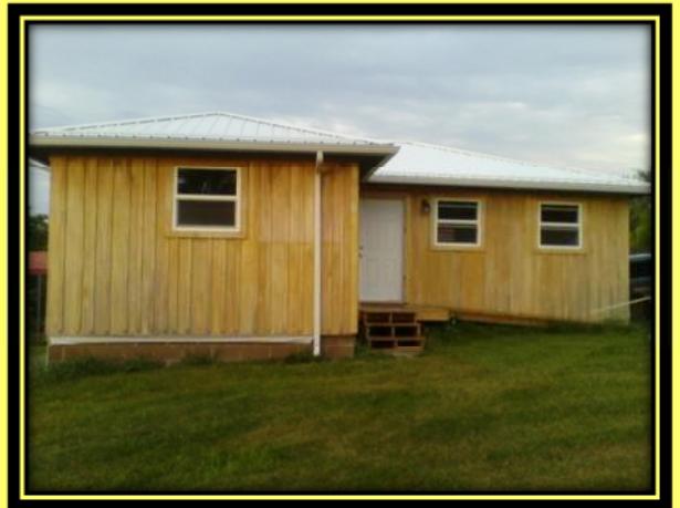
"Prabhupada House" in New Vrindaban

As I was setting up the IPM office, a devotee came by and told us that this particular room had been Prabhupada's bedroom. I am very touched by this transcendental kindness to an undeserving soul. As I am sitting here, I look at the many bookshelves lining the room, filled with the very books Prabhupada spend countless hours translating, forgoing sleep and comfort. It is such a special feeling to spend hours in this room, sharing Prabhupada's instructions with the inmates and launching his books to prisons all over United States.