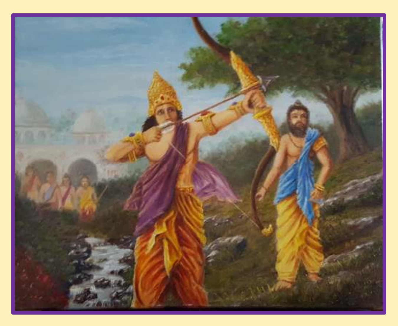
Painting by Bhakta David Bukrman — Arjuna -"I only see the neck of the bird"-