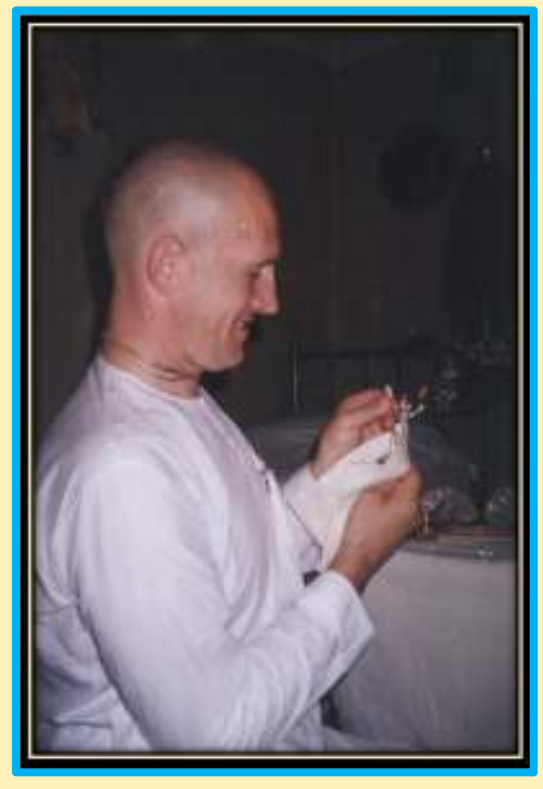
Page 2 of 8